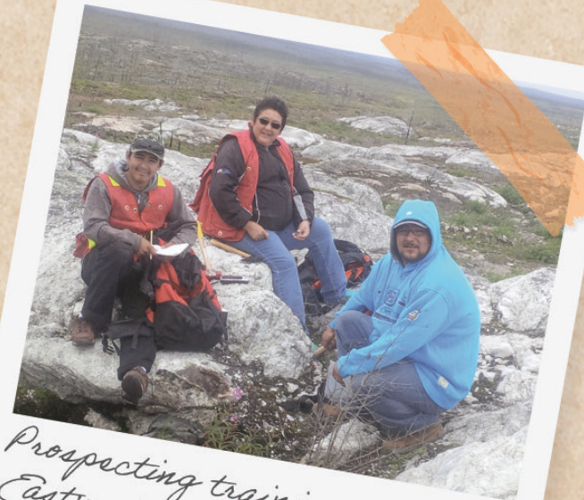
Prospecting training, Eastmain