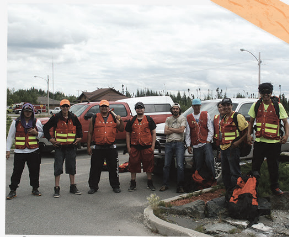
Prospecting training Ouje-Bougoumou