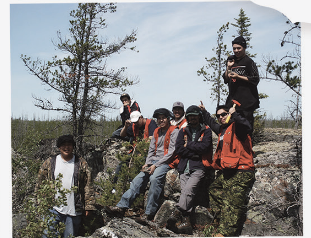
Prospector Training Photo Break