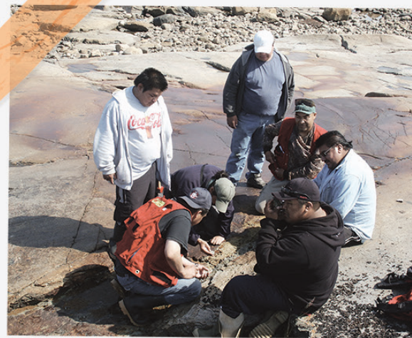
Prospecting Training Whapmagoostui