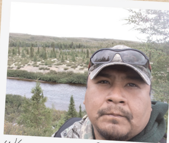
Whapmagoostui Prospector Rock Sheshamush