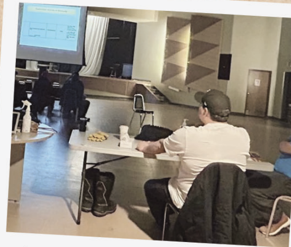
Wemindji Mining 101