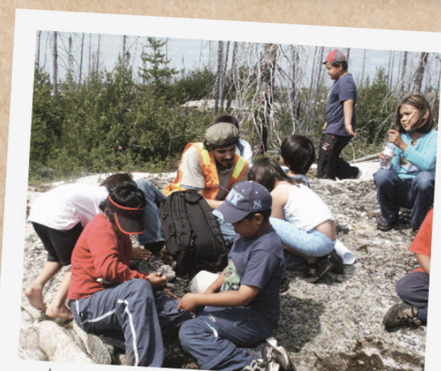
Whapmagoostui Prospector Rock Sheshamush