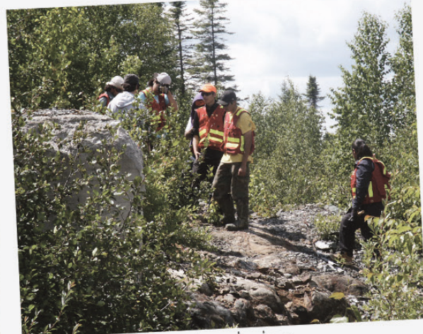
Prospecting training Ouje-Bougoumou Field Work