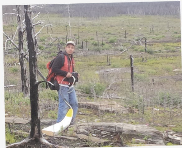
Prospector Geophysics training