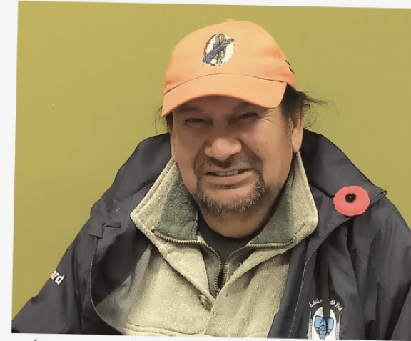
Kenny Wapachee Project prospecting