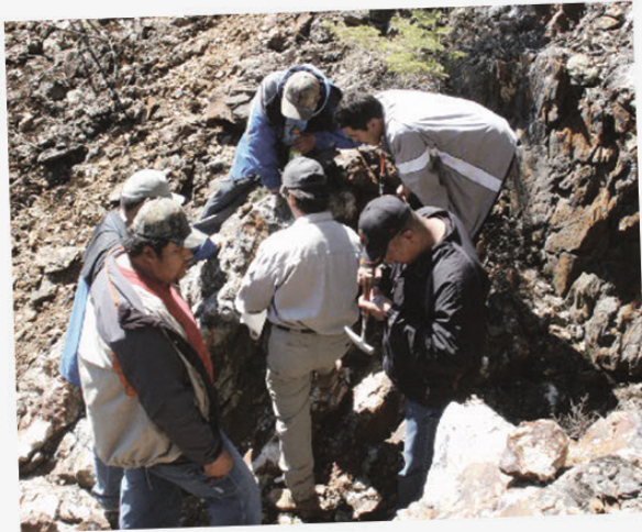
New Prospecting Students