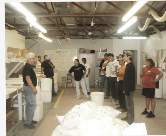
Prospecting Training Malartic Mine visiting Washaw Sibi