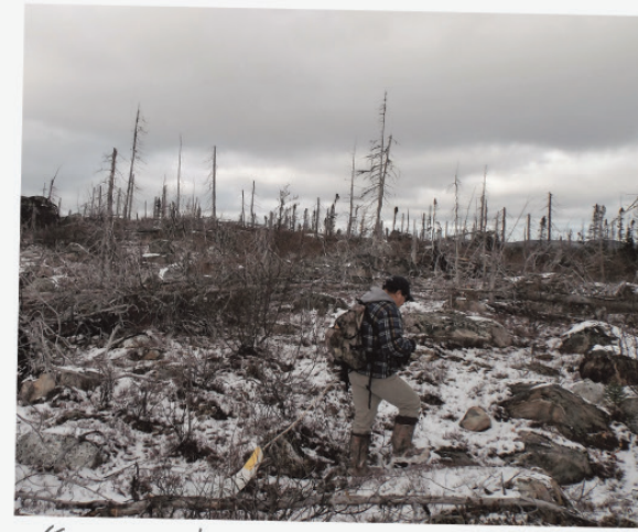
Kenny Wapachee Project prospecting