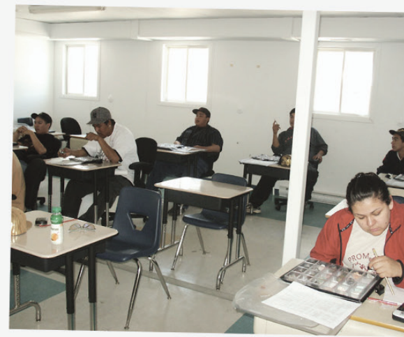
Prospecting training Class, Eastmain